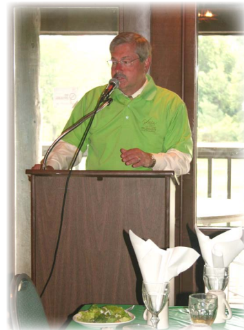
Iowa Governor, Terry Brandstad speaks at the Valley Bank Annual Teen Challenge Golf Marathon Banquet