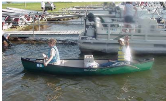
One of our students and his wife during the Big Creek outing