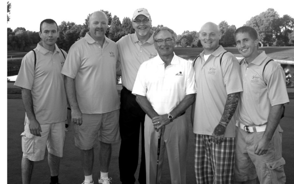
Teen Challenge of the Midlands staff, students and outside golfers all contributed to making this year's golf marathon a great success for the ministry!