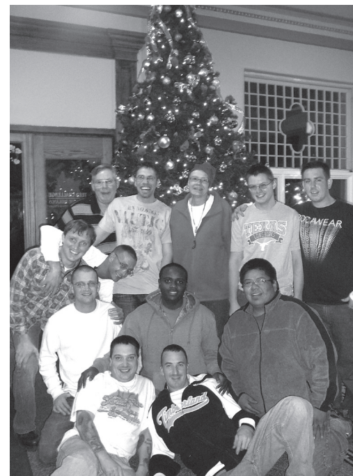
Some of our Teen Challenge students and staff gathered by our Christmas tree.

“Teen Challenge has been extremely blessed by those who have given so much of themselves through prayers, finances, time and their gifts and talents. If they just realized how important their ministry is to Teen Challenge, and how grateful we are as they give of themselves so that we can continue God’s plan for T.C.!”